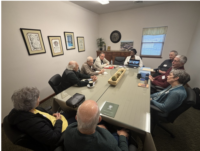
This is a group who met during ACA for the final Book Study session.