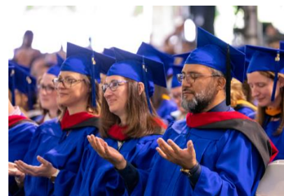
Seminary graduates receive a blessing at EMU commencement

On May 7, EMS celebrated its largest graduating class since before the pandemic in 2019. Nineteen graduates earned master's degrees in Christian leadership, divinity, and religion; and certificates in Christian studies, general theology, and faith-based peacebuilding. 2022-23 seminary enrollment was strong, with a 14% increase over the previous year.