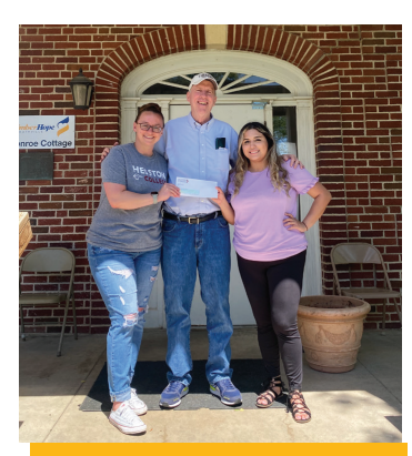
The 2023 and 2024 nursing club presidents present a $1,000 check to New Hope Shelter.