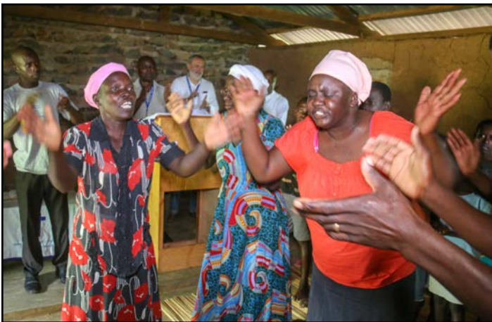
Women dance in worship in Kisumu, Kenya, in 2018.