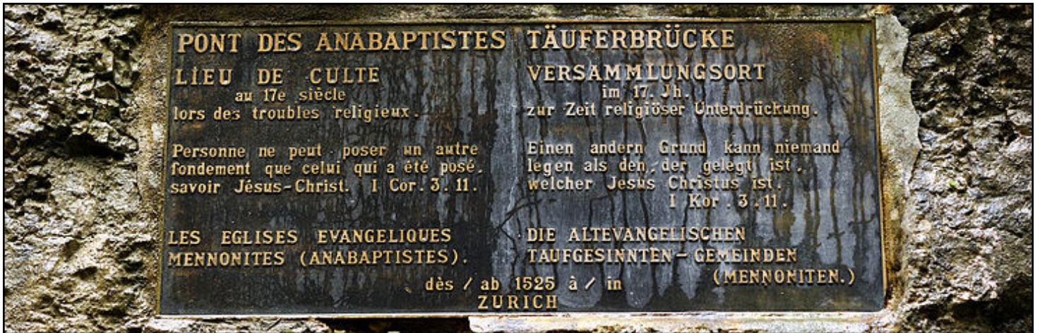
A marker stone identifies the "Anabaptist bridge" in Zurich, Switzerland.

Anabaptist World Fellowship Sunday is an annual event for MWC member congregations around the world, worshipping together in spirit using the same worship resources, knowing that we belong to each other in this global family of faith.