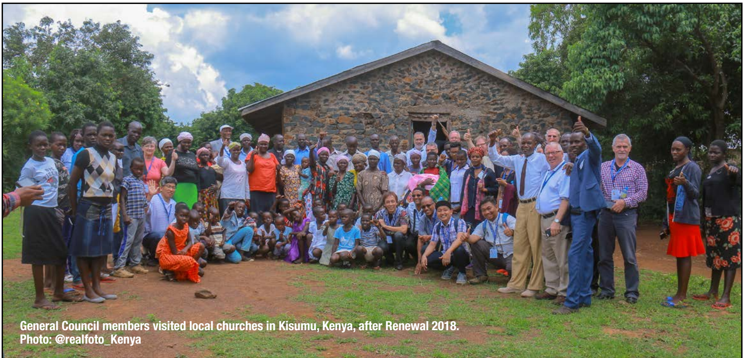
General Council members visited local churches in Kisumu, Kenya, after Renewal 2018.

The biblical texts, prayers, song suggestions, sermon ideas and other resources in this package have been prepared by members of MWC out of their experience in their local context. The teaching does not necessary represent an official MWC position.