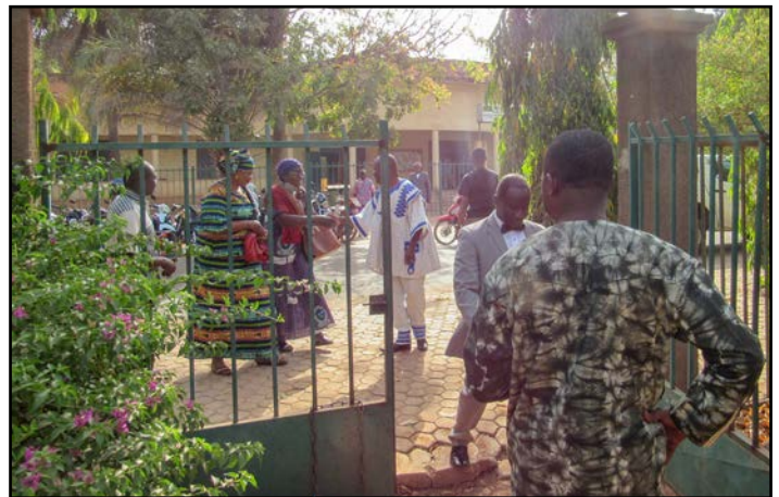
Church members greet each other after a service in Burkina Faso in 2020.