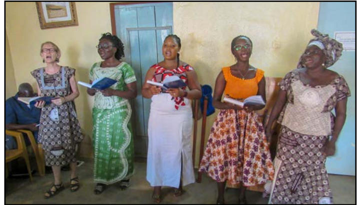
Church members sing in Ouagadougou, Burkina Faso, during the Deacons delegation visit in 2020.