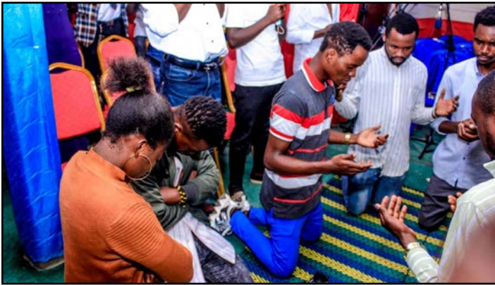
A service of thanksgiving for graduates at Paroisse Missionnaire Shalom de Bukavu in DR Congo.

without having seen him. This man said to himself that the day when Jesus would pass by him, he would not miss the opportunity to challenge him. His hope was in Jesus.