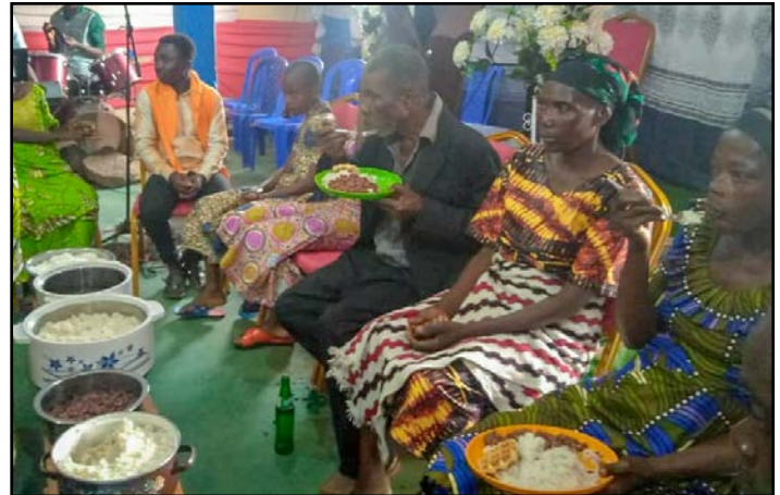
Anabaptist World Fellowship Sunday celebration at Paroisse Missionnaire Shalom de Bukavu in DR Congo.

together before or after worship on Anabaptist World Fellowship Sunday.