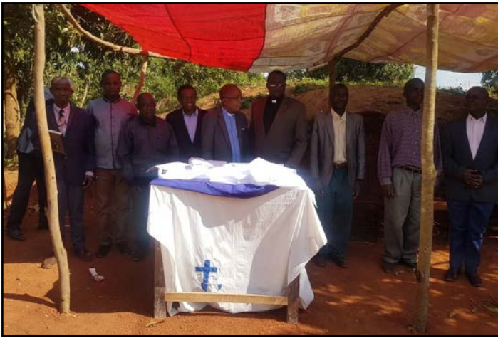
Brethren in Christ Church Mozambique annual general conference July 2022 in Milange, Mozambique.

God is our home, our refuge and our hope in times of trial.