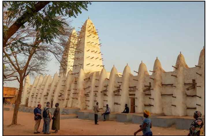
A mosque in Burkina Faso.

Jesus is our hope: even if we go through the valley of the shadow of death, he is by our side.