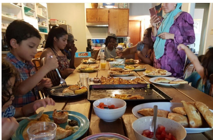
Casa de Maria y Marta in San Antonio, Texas, serves refugees seeking asylum.

We remember the amazing way a dozen or so Ohio Conference churches came together to assemble 175 immigration welcome kits in the fall of 2019. COVID-19 precautions prevent this kind of