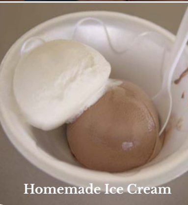
Homemade Ice Cream

Train rides, Kid's Auction, games and fun activities