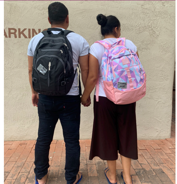
A husband and wife from southern Mexico received immigration detainee care kits at the Inn Project in Tucson, Arizona, a shelter that offers hospitality to asylum-seeking families.

Thank you for your generosity. To learn more about how you can support immigrants and asylum seekers, call 888.563.4676 (toll-free) or visit mcc.org/stories/4-ways .