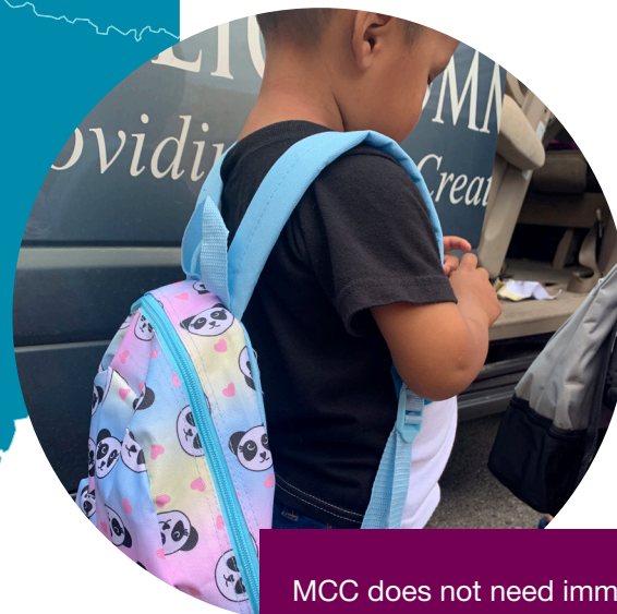
This child chose a panda backpack kit while staying at the Inn Project shelter in Tucson.

MCC does not need immigration detainee care kits at this time. Visit mcc.org/kits to learn about other kits that are needed.