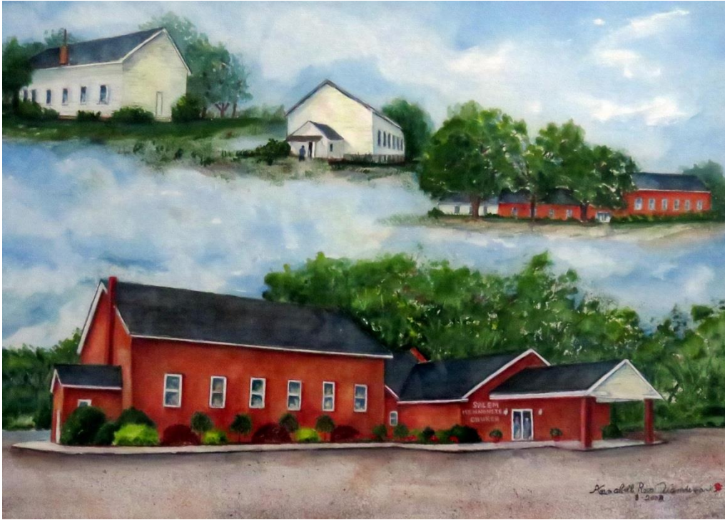
Painting Courtesy of Annabelle Vandemark