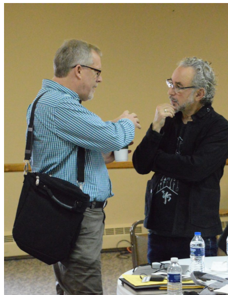
To see more photos from the missional conference, go to http://bit.ly/2017MissionalConferencePhotos .