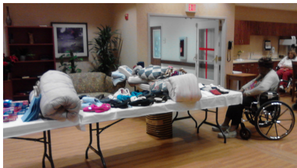
On Dec. 5 the congregation held a Christmas concert and distributed blankets, clothing and personal care items to nursing home residents.